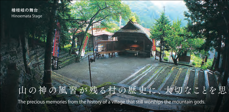
檜枝岐の舞台 Hinoemata Stage