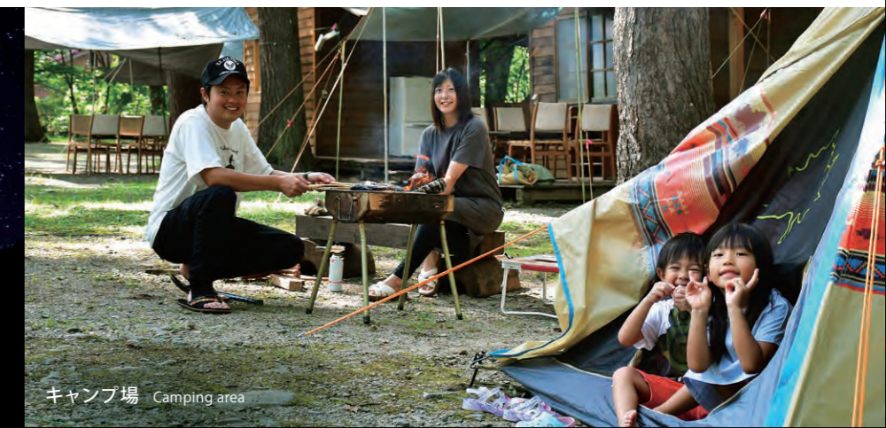
キャンプ場 Camping area

It's no exaggeration to call the beauty of the night sky in Hinoemata a scattering of gemstones. The view from Nanairi and Mt. Aizukoma is particularly highly evaluated. You can also see lots of shooting stars.