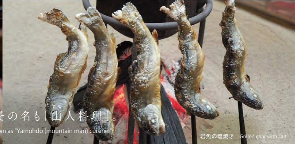
岩魚の塩焼き Grilled char with salt

The cuisine has its roots in the meals prepared by men working in the mountains in the past. It is known as "Yamohdo (mountain man) cuisine."