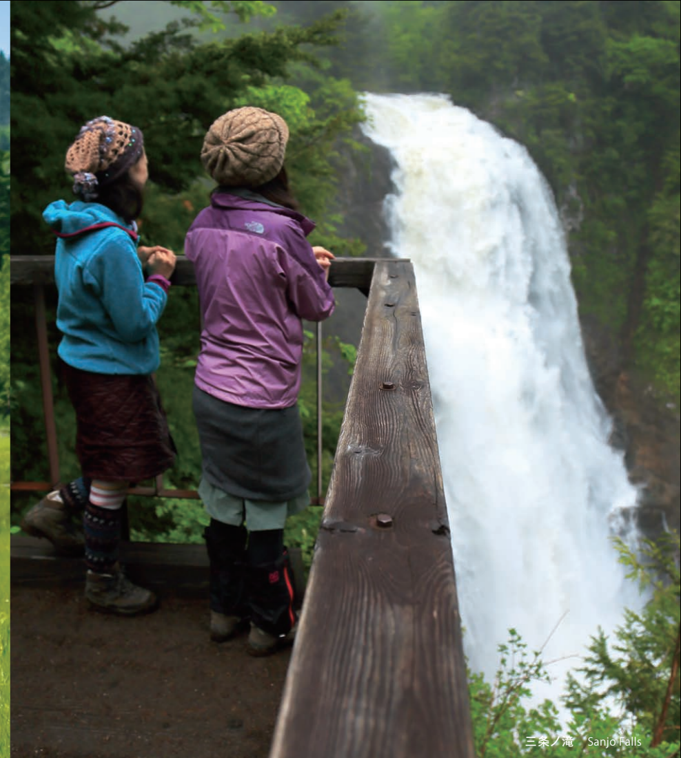
三条ノ滝 Sanjo Falls

Here you will find an exterior route of wooden paths approximately 7km in length, and which can be walked in around 3 hours. The views of Mt. Hiuchi are particularly incredible from the vicinity of Sanpeishita on the east side of the marsh.