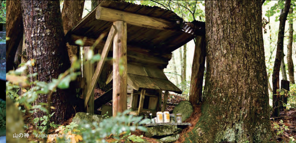
山の神 Yama no Kami