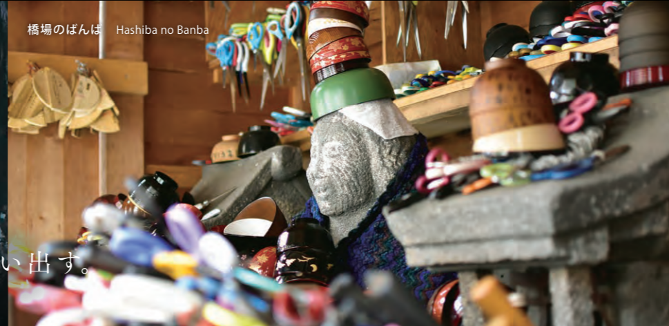
橋場のばんば Hashiba no Banba

The precious memories from the history of a village that still worships the mountain gods.