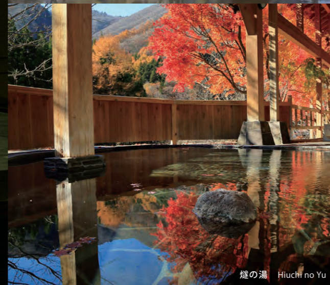
燧の湯 Hiuchi no Yu