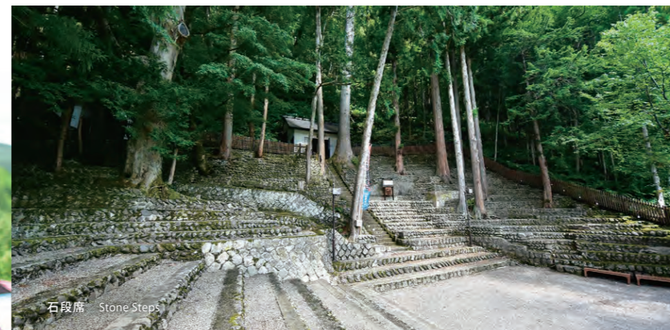
石段席 Stone Steps