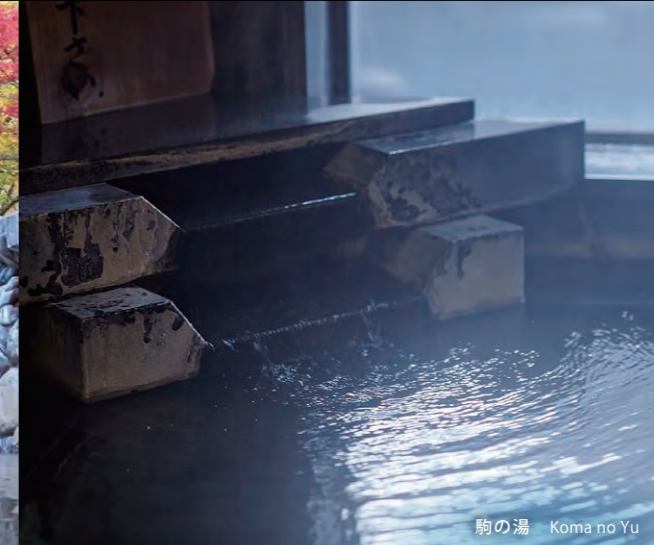
駒の湯 Koma no Yu