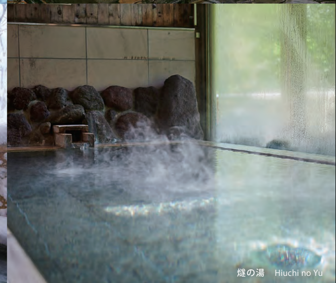
燧の湯 Hiuchi no Yu