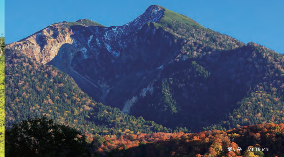
燧ヶ岳 Mt. Hiuchi

Two pools, seemingly placed almost calculatingly on a smooth sloping marsh at an elevation of 1950m. The wooden path curving between them as it winds toward Mt. Hiuchi makes quite a striking impression.