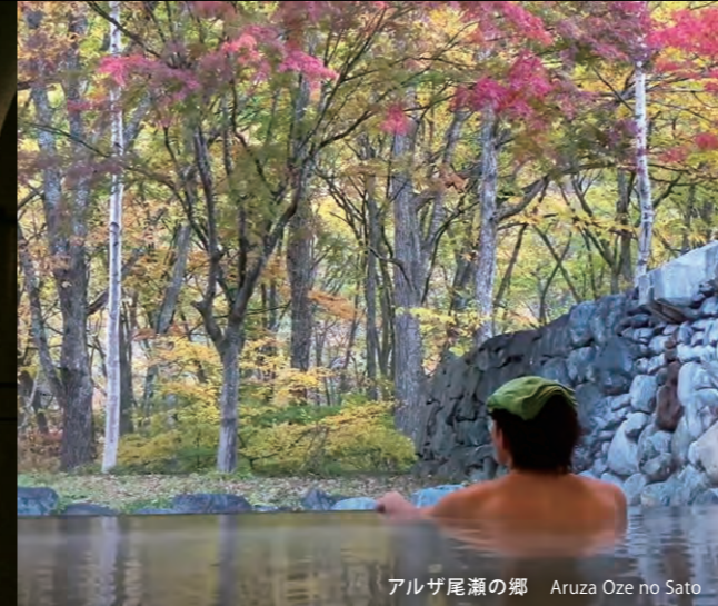
アルザ尾瀬の郷 Aruza Oze no Sato

A combined hot spring and sports facility located in the Ozehinoemata Roadside Station. The hot spring zone allows you to feel at one with nature, looking out through expansive windows. You can also refresh with water activities in the pool zone.