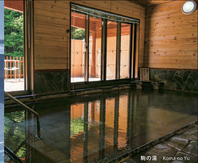
駒の湯 Koma no Yu