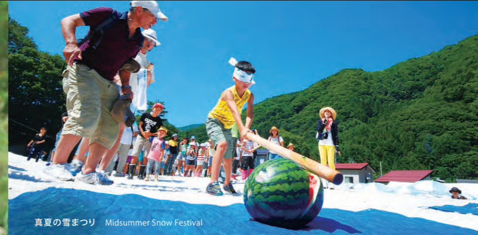
真夏の雪まつり Midsummer Snow Festival