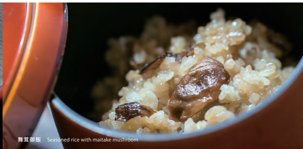
舞茸御飯 Seasoned rice with maitake mushroom