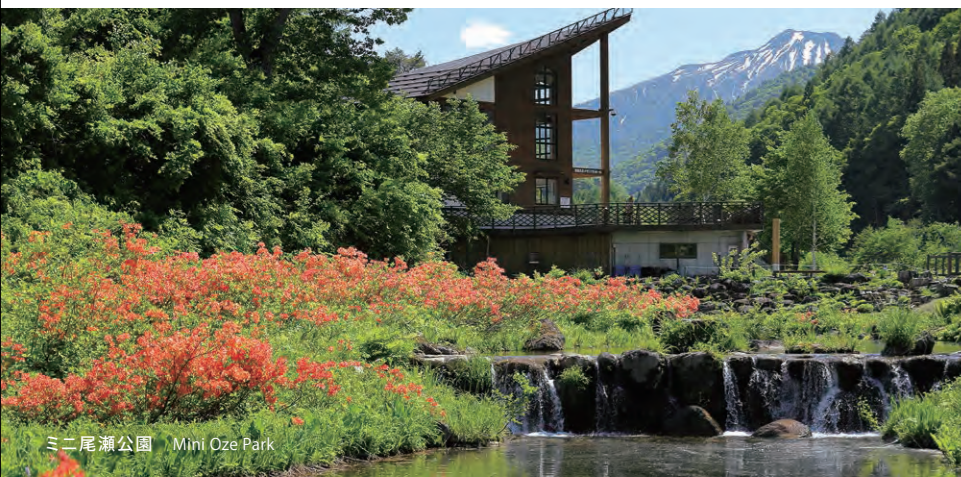
ミニ尾瀬公園 Mini Oze Park

A storeroom that was once said to hold grains and other produce. The building has a long history, and is also characterized by a construction that uses no nails or pillars. One of the oldest structures found in the village today.