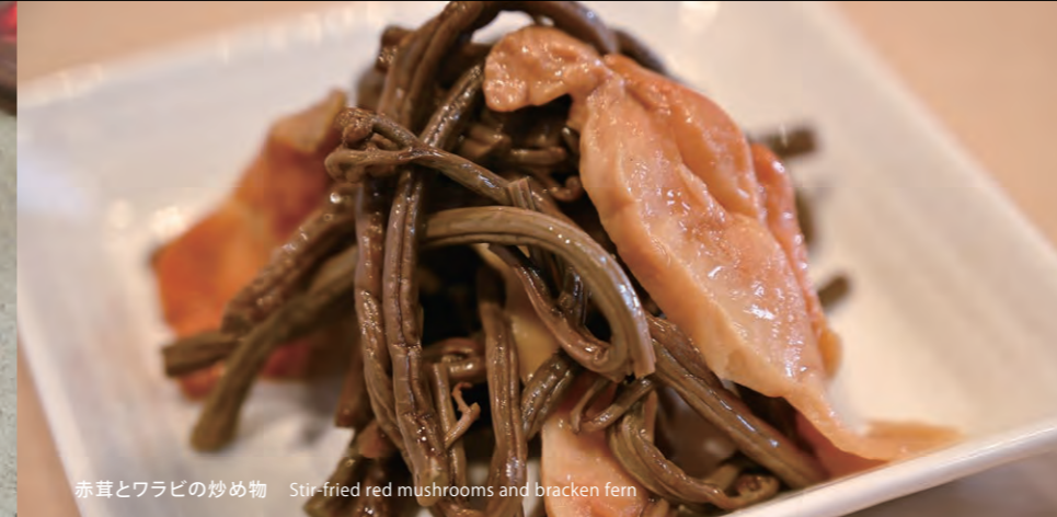
赤茸とワラビの炒め物 Stir-fried red mushrooms and bracken fern