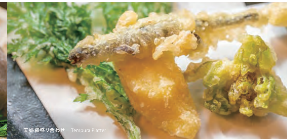
天婦羅盛り合わせ Tempura Platter