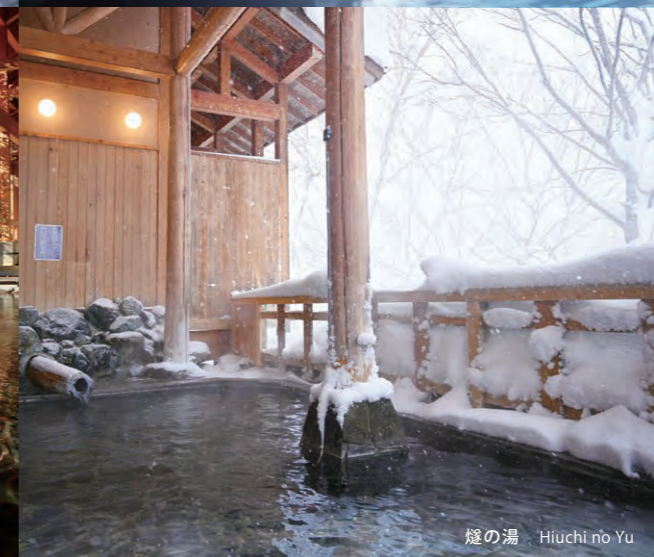
燧の湯 Hiuchi no Yu