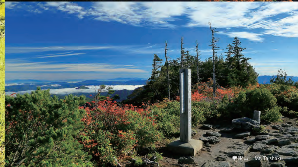
帝釈山 Mt. Taishaku