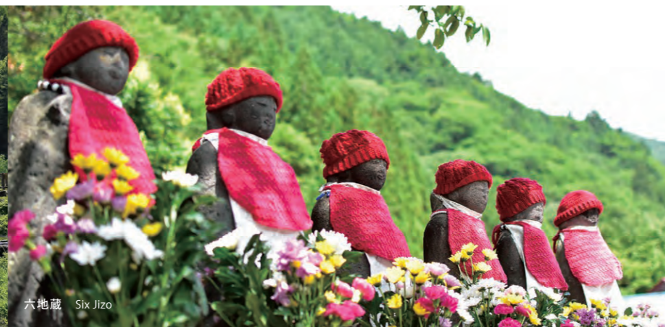
六地藏 Six Jizo